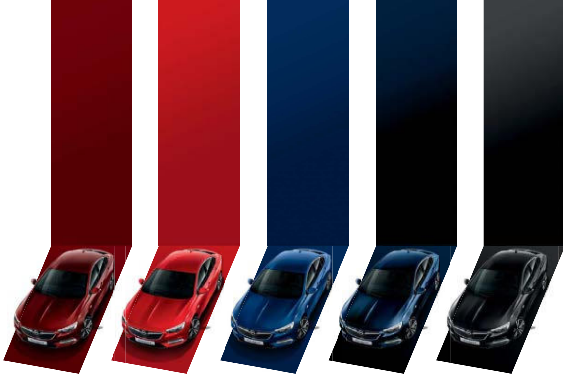
2018 MAZDA3 S4 1.8S 1.8S